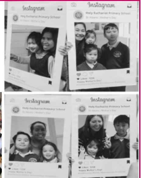
Some of the insta frame snaps from the morning #holyeucharistmothersday2024